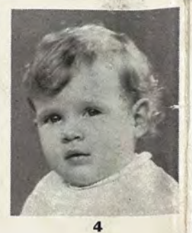
THIS MONTH'S COMPETITION