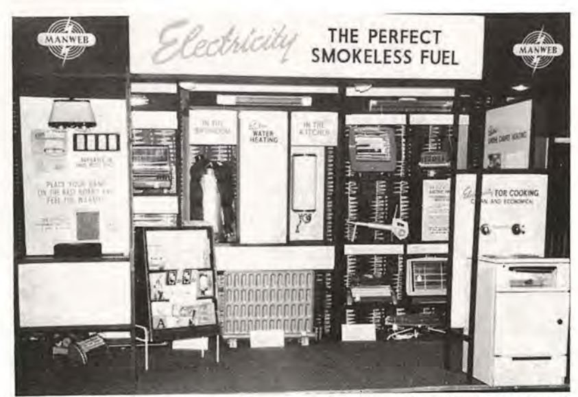
The above photograph shows a section of the Board's stand at the Kirkby U.D.C. 'Clean Air' Exhibition. On display were various types of electric heating appliances, water heaters and electric cookers.