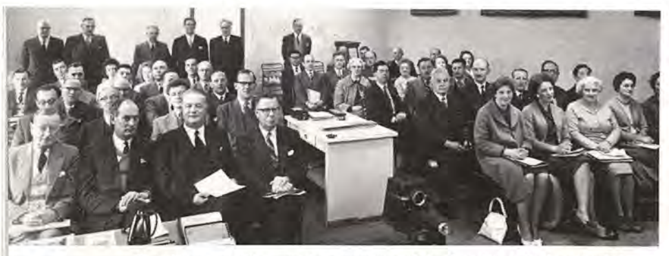
The pictures on this page show members of the Board's staff who attended the Bangor conference.