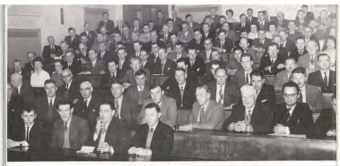
This picture shows most of those who took part in the Denbigh Conference.