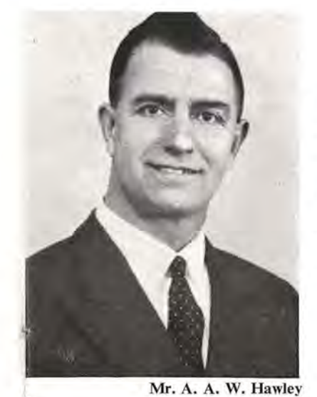
MAINLY ABOUT PEOPLE