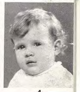
THIS MONTH'S COMPETITION